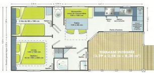
Mistral BIG WIDTH + BREEZES SEEN TERRACES SLIDING

*Possibility 5eme person under tent (not supplied) at the price list daily supplement fixed price