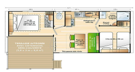
Giono / Giono Plus

More photos: http://www.facebook.com/pages/Camping-La-Farigoulette/192487227429720